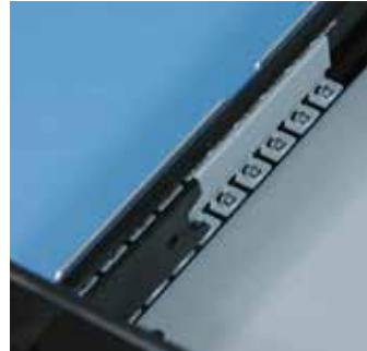
Drawer Glides Effortlessly on Side Rails with 24 Steel Ball Bearings per Rail