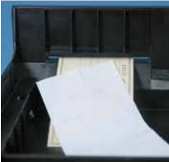
Checks And Card Slips Can be Inserted into the Media Slots Without Opening the Drawer