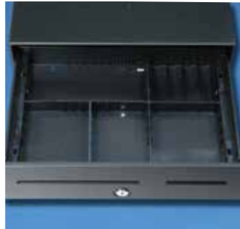
Configure the Storage Area to Your Needs Using the Adjustable Partitions Provided