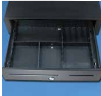
Configure the Storage Area to Your Needs Using the Adjustable Partitions Provided