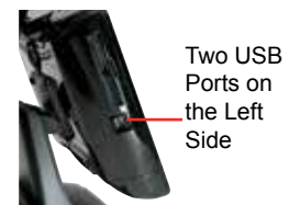
Two USB Ports on the Left Side