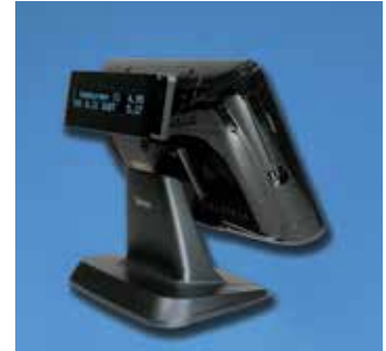
Optional Integrated Rear VFD Customer Display