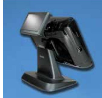
Optional Integrated 7" Rear LCD Customer Display