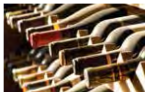
Tobacco Stores / Bars / Liquor Stores