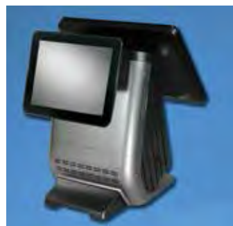
Optional Integrated 9.7" LCD Customer Display