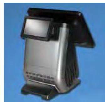
Optional Integrated 7" LCD Customer Display