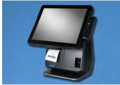
Card Reader / Printer / Fingerprint Reader