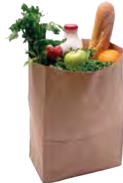
Convenience Stores / Small Grocery Stores