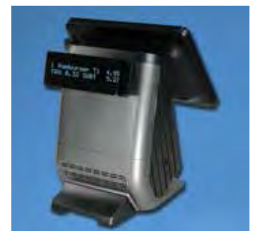
Optional Integrated VFD Customer Display