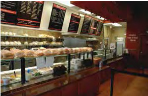
Cafeterias / Quick Service Restaurants