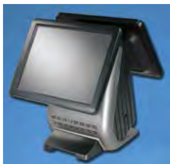
Optional Integrated 15" LCD Customer Display