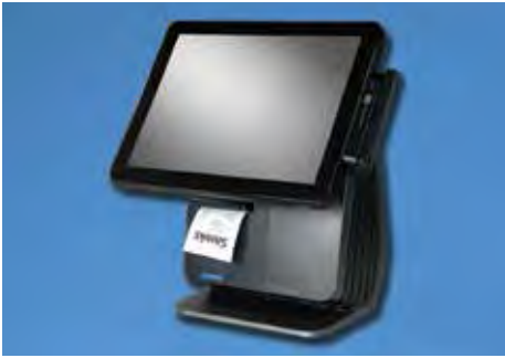
Card Reader / Printer