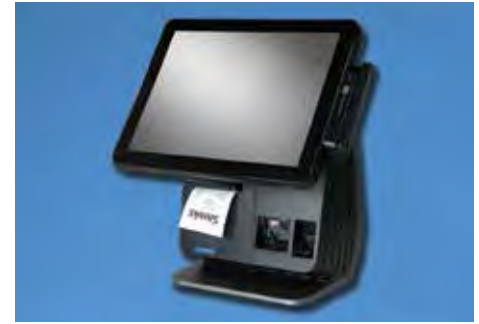
Card Reader / Printer / Scanner + Fingerprint Reader