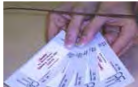
Theater Concessions / Ticket Booths / Box Offices