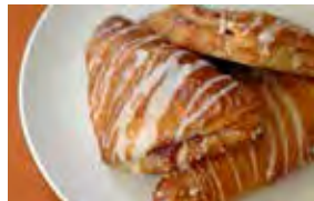
Dusty Environments Like Pizza and Bakeries