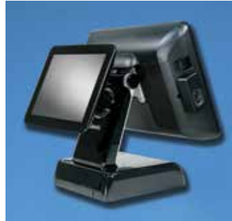
Optional Integrated 9.7" Rear LCD Customer Display