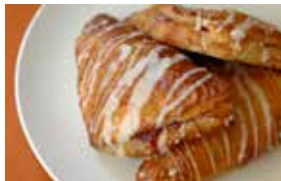
Dusty Environments Like Pizza and Bakeries