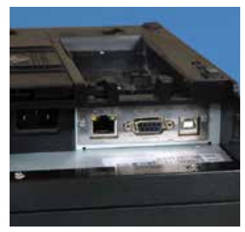
Concealed, Yet Easy to Access Power Supply – Choose Between USB+Serial or USB+ Serial+Ethernet Interfaces