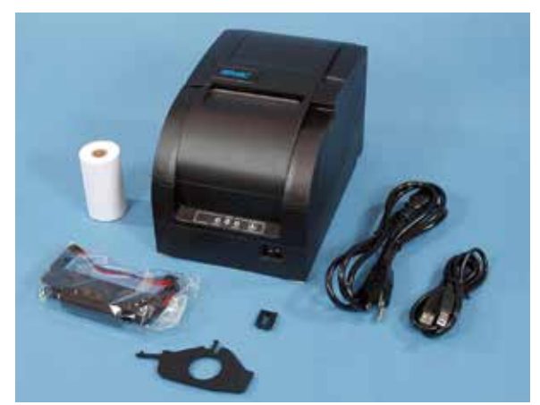
Contains Everything Necessary - Including the Communication Cables – in the Carton