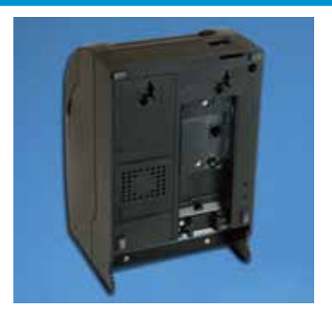
Cash Drawer Port Located on the Bottom – Built-In Wall Mount Capability