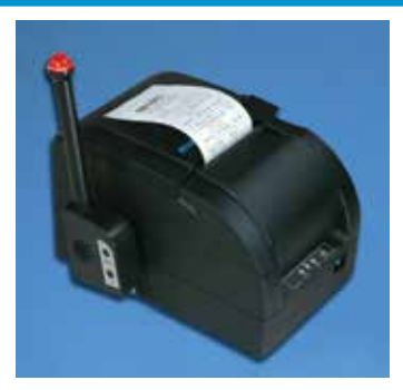
Optional Audio/Visual Print Messenger