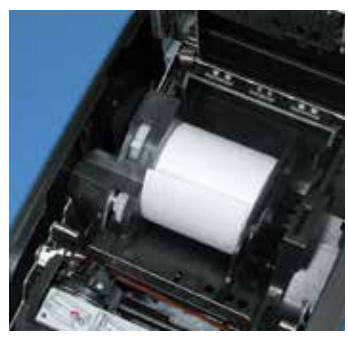
Drop and Print Paper Loading with Built-In Paper Width Selector