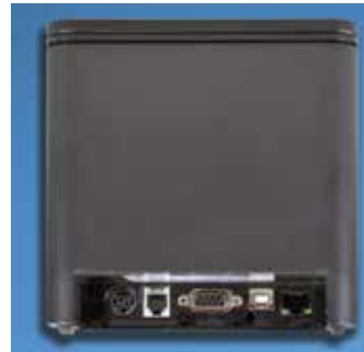
Triple Interface Standard – USB+Serial+Ethernet – Cash Drawer Port Standard