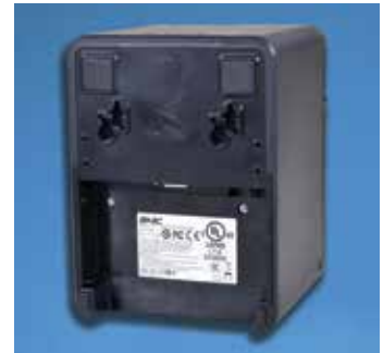
Built-In Wall Mount Capability