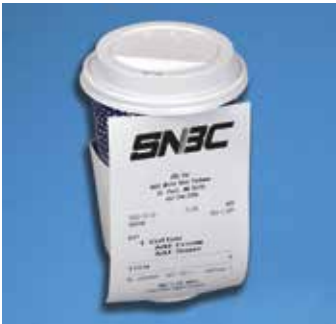
Compatible with MAXStick Adhesive Thermal Linerless Sticky Receipt Paper