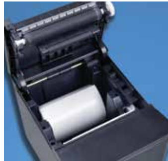
Drop and Print Paper Loading with Standard Paper Width Selector