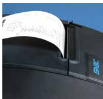
Liquid Guard Built Into the Cabinet Design