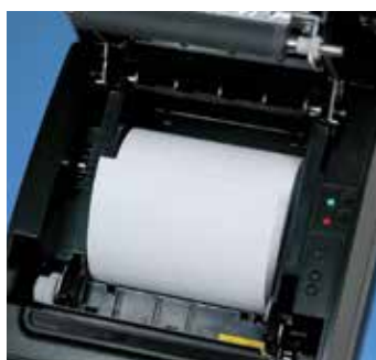
Drop and Print Paper Loading