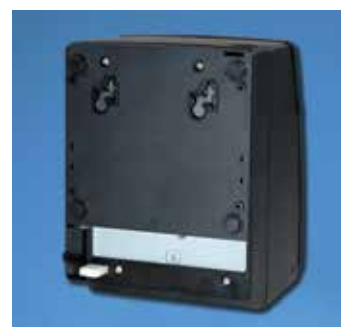
Built-In Wall Mount Capability