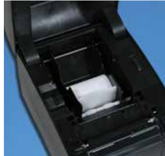
Drop and Print Paper Loading with an Adjustable Paper Width Selector