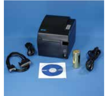
Includes Everything Necessary in the Carton