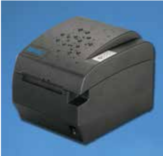
Spill-Proof Design is Especially Suitable for Kitchens and Bars