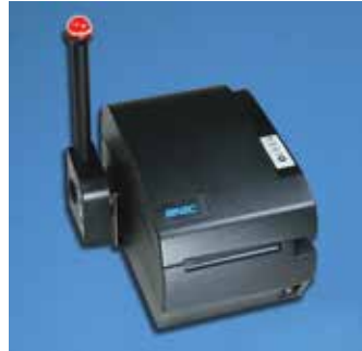
Optional Audio/Visual Print Messenger