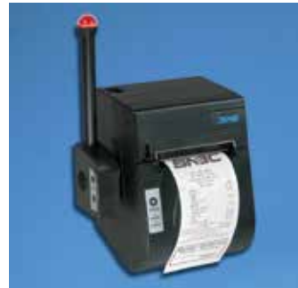
Built-In Wall Mount Capability and Optional Audio/Visual Print Messenger