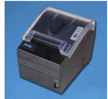
Optional Spill Cover