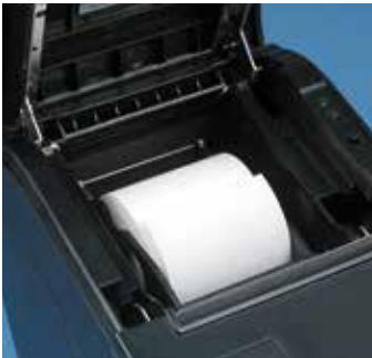
Drop and Print Paper Loading with an Adjustable Paper Width Selector