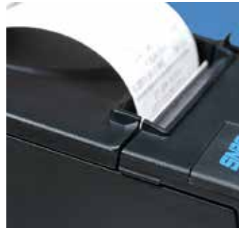
Liquid Guard Built Into the Cabinet Design