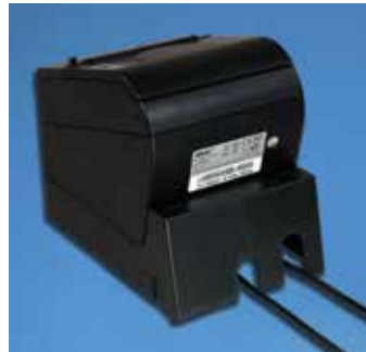
Optional Power Supply Cover with Cable Management Slots