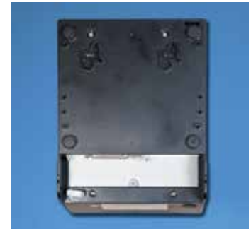
Built-In Wall Mount Capability