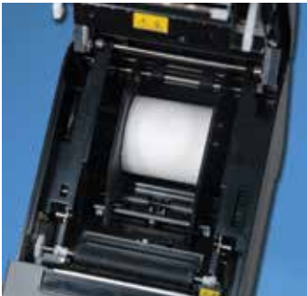
Drop and Print Paper Loading with an Adjustable Paper Width Selector