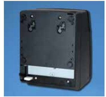
Built-In Wall Mount Capability