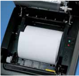
Drop and Print Paper Loading