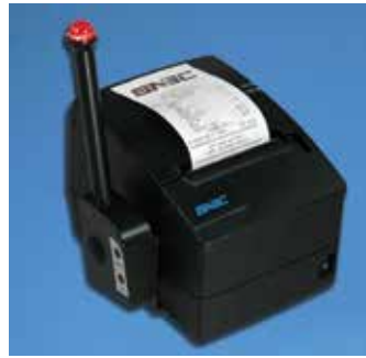
Optional Audio/Visual Print Messenger