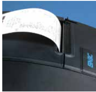
Liquid Guard Built Into the Cabinet Design