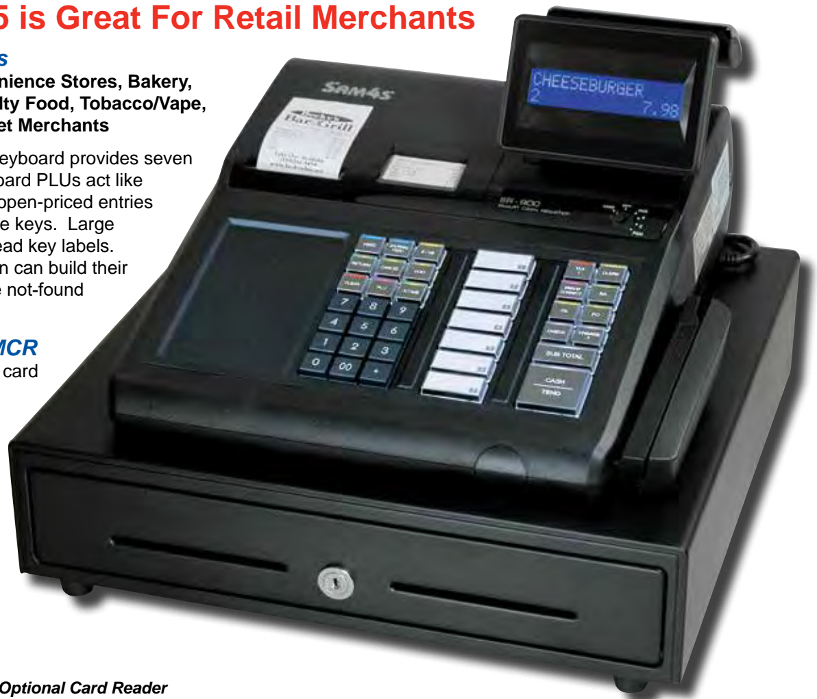
SAM4s ER-915 Shown With Optional Card Reader

Use the optional integrated card reader to swipe payment cards when integrated payment options are implemented.