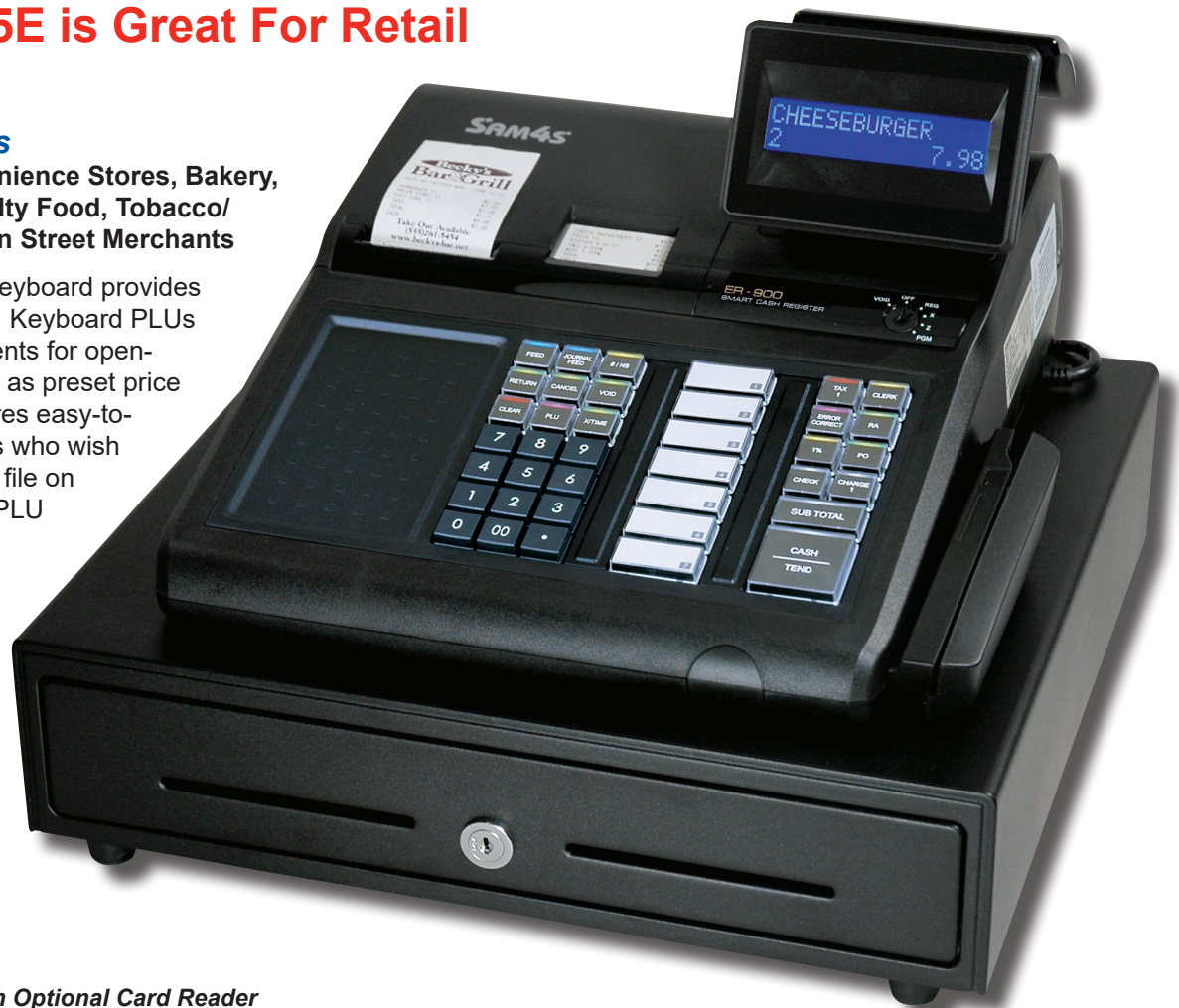
SAM4s ER-915E Shown With Optional Card Reader

Use the optional integrated card reader to swipe payment cards when integrated payment options are implemented.