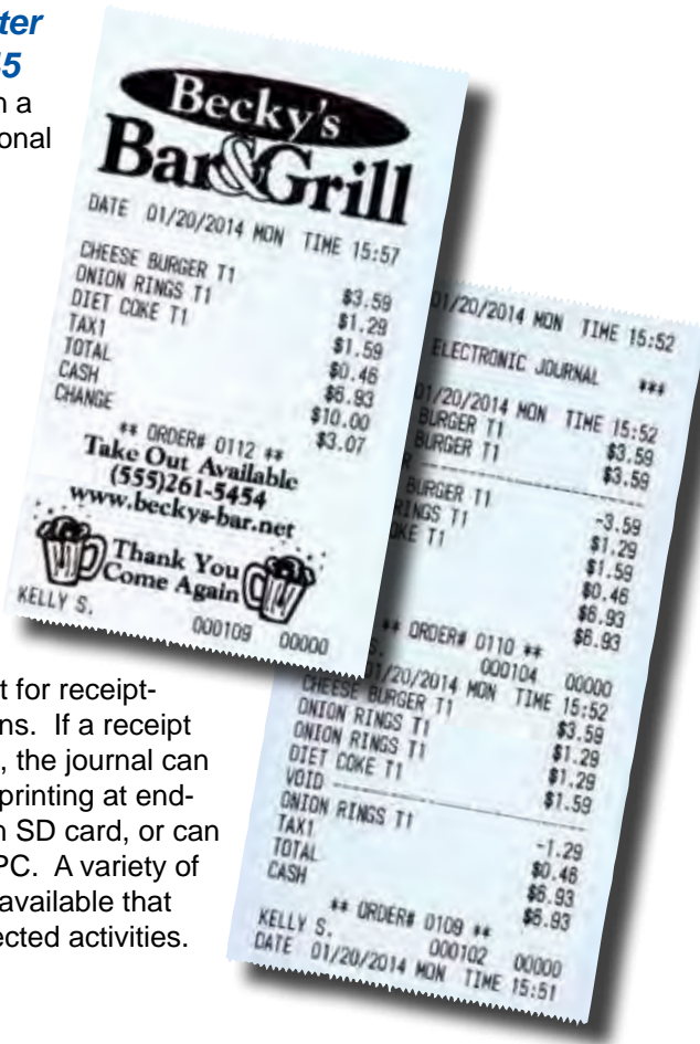
Receipt Featuring Graphic Logo and Message Shown 75% Actual Size

Single printer models are best for receipt-only or journal-only applications. If a receipt and a sales journal is needed, the journal can be archived electronically for printing at end-of-day, can be collected on an SD card, or can be polled and collected by a PC. A variety of electronic journal reports are available that allow you to quickly audit selected activities.