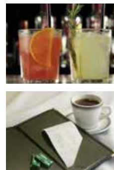
Bars / Table Service Restaurants