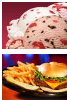
Ice Cream / Quick Service