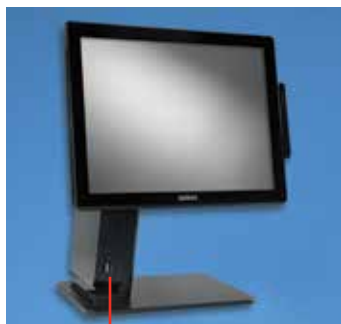
Two Additional USB Ports – Choice of Processors