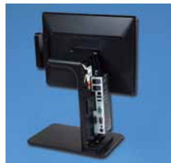
Easy Access to Ports – Easily Replace SSD and RAM Without Tools