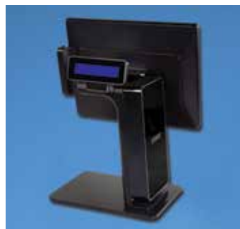
Optional Integrated 2-Line LCD Customer Display