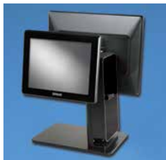
Choose From 9.7" or 15" Optional Integrated Rear LCD Customer Displays