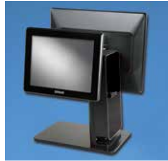
Choose From 9.7" or 15" Optional Integrated Rear LCD Customer Displays