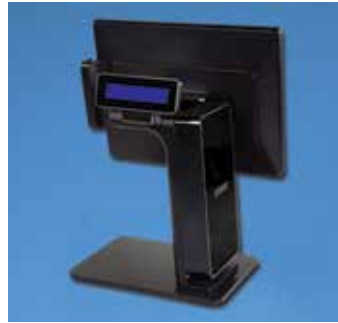
Optional Integrated 2-Line LCD Customer Display