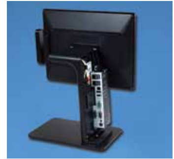
Easy Access to Ports – Easily Replace SSD and RAM Without Tools