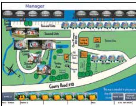
Customized graphical table maps.