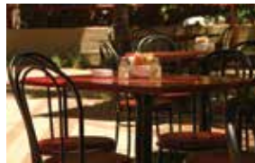
Food Concessions / Fast Casual Restaurants