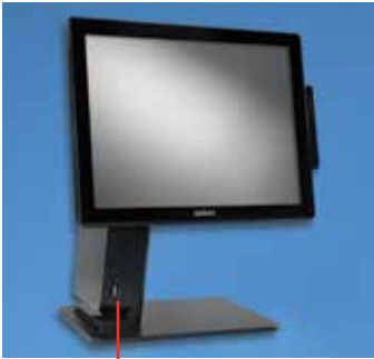
Two Additional USB Ports – Conveniently Place a Printer Under the Touch Screen