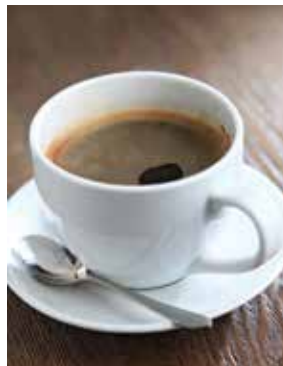
Bars / Ice Cream Parlors / Coffee Shops