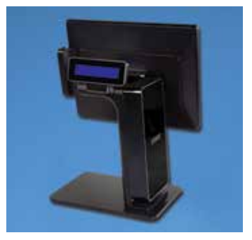
Optional Integrated 2-Line LCD Customer Display