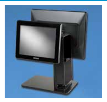
Choose From 9.7" or 15" Ontional Integrated Pear I CD