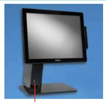
Two Additional USB Ports -Choice of Processors