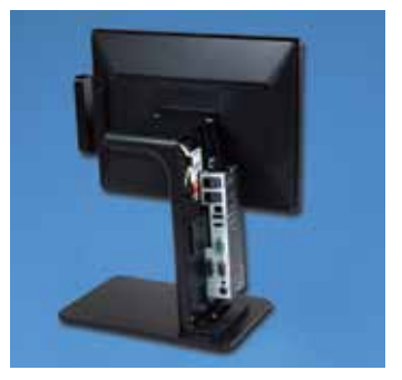
Easy Access to Ports -Fasily Replace SSD and RAM