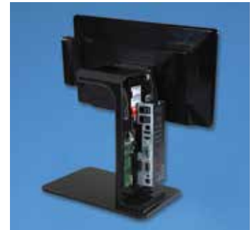
Easy Access to Ports – Easily Replace SSD and RAM Without Tools