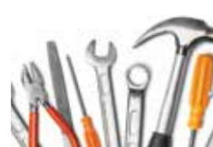
Hardware, Paint or General Retail Stores