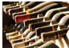
Tobacco Stores / Liquor Stores