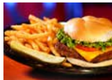
Quick Service / Fast Casual