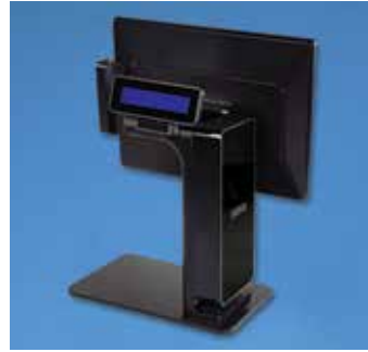
Optional Integrated 2-Line LCD Customer Display