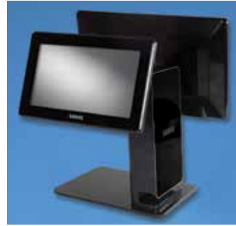
Choose From 10.1" or 15.6" Optional Integrated Rear LCD Customer Displays