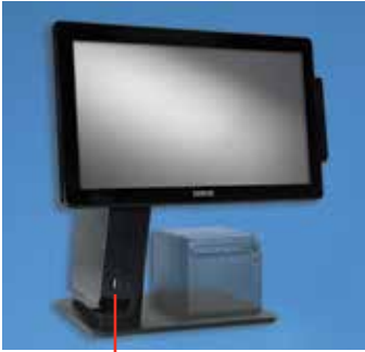
Two Additional USB Ports – Choice of Processors