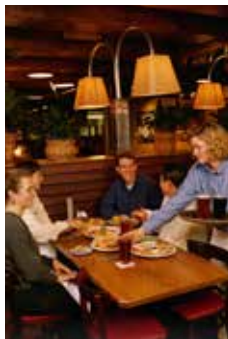
Bars / Table Service Restaurants