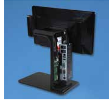
Easy Access to Ports – Easily Replace SSD and RAM Without Tools