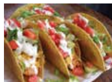
Quick Service / Fast Casual