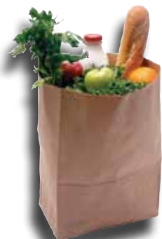
Convenience / Small Grocery