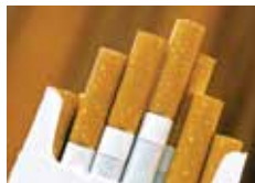
Tobacco Stores / Liquor Stores