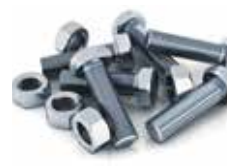
Hardware, Paint or General Retail Stores