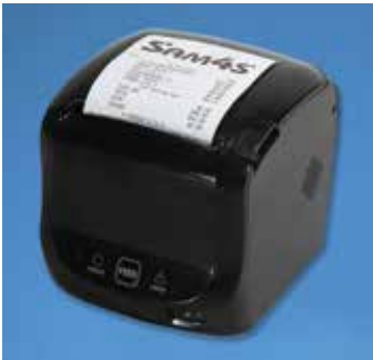
The Giant 100 Accommodates Up to 3" Wide Thermal Receipt Paper