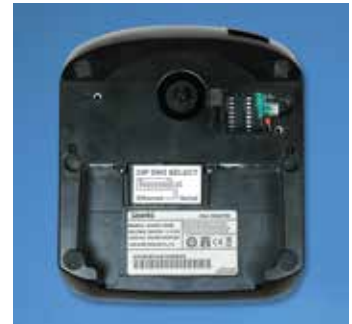
Easy Access to Dip-Switches / Tool-Free Access Optimizes Serviceability