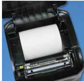
Drop and Print Paper Loading – Optional Paper Width Selector Allows 58mm Wide Paper Rolls