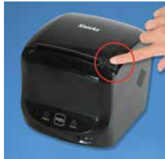
Designed for Jam-Free Operation