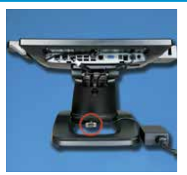
Cable Management Keeps Cords Hidden and Organized (RJ48-DB9M Adaptor Included)