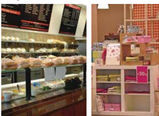
Cafeterias / Discount Stores

Dusty Environments Like Pizza and Bakeries