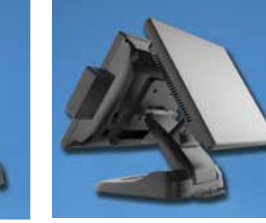
Optional Integrated 10" or 15" (Shown) Rear LCD Customer Display