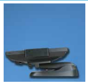
Double Articulating Terminal Folds Flat