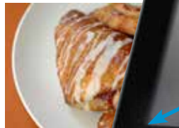
Dusty Environments Like Pizza and Bakery