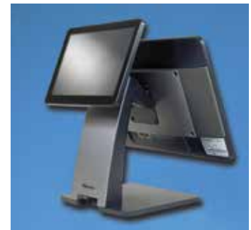
Optional Integrated 10.1" (Shown) or 15.6" Rear LCD Customer Display