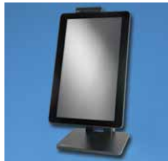
Screen Can Be Rotated to a Vertical Position