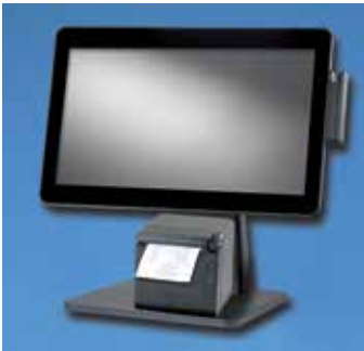
Save Space By Placing a Printer Under the Screen