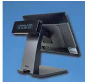
Optional Integrated Rear 2 Lines by 20 Characters VFD Customer Display