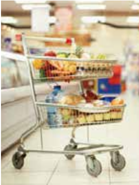
Convenience Stores / Small Grocery Stores