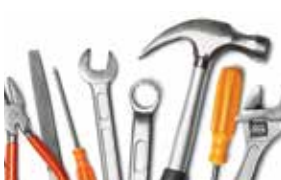
Hardware, Paint or General Retail Stores

Fanless High Powered POS Terminal Designed For Optimum Performance and Dependability