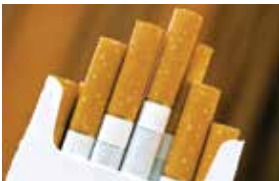
Tobacco Stores / Liquor Stores