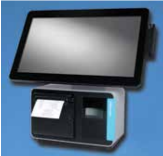
Conserve Counter Space With the Optional Cube X Combination Integrated Printer / Scanner