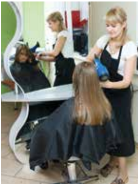
Salons / Apparel Stores