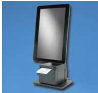
Screen Can Be Rotated – Place a Printer Under the Screen Using the Optional Extension Bracket