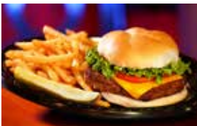
Quick Service and Table Service Restaurants