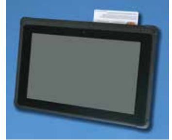
Integrated Card Reader Standard