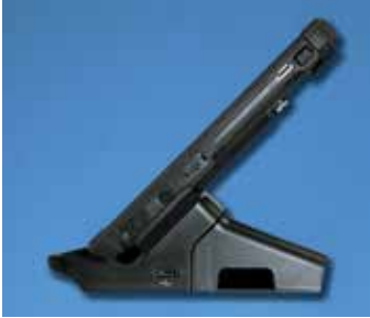
Stylish, Space-Saving Rugged Tablet and Docking Station