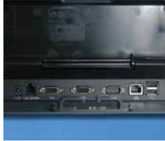
Lift the Rear Panel to Access the Docking Station's Ports