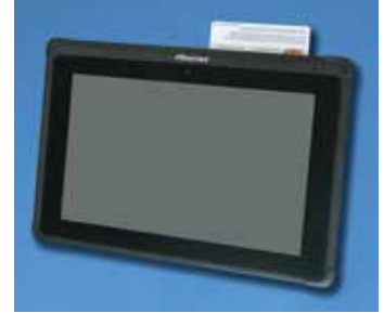
Integrated Card Reader Standard