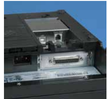
Concealed, Yet Easy to Access Power Supply – Dual Interface Boards Allow a Variety of Configurations