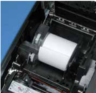
Drop and Print Paper Loading with Built-In Paper Width Selector