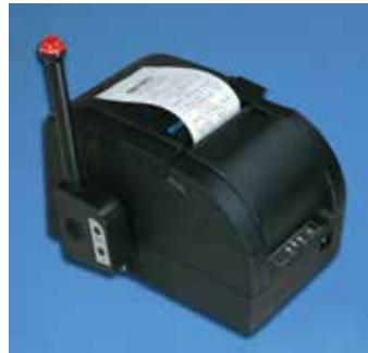
Optional Audio/Visual Print Messenger