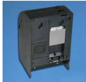
Built-In Wall Mount Capability