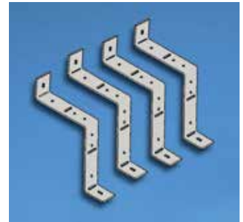
Easily Mounts Under the Counter with Optional Universal Brackets