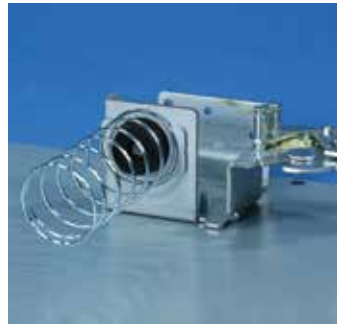
Heavy Duty Latch Mechanism