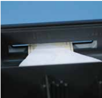
Large Storage Area Under the Coin Section