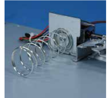
Heavy Duty 2-Stage Latch Mechanism