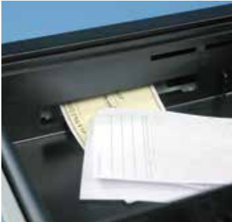
Large Storage Area Under the Insert