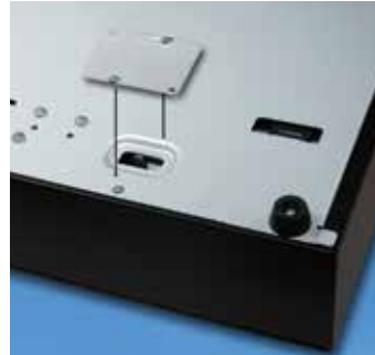
Optional Release Lever Cover Prevents Access to Manual Release