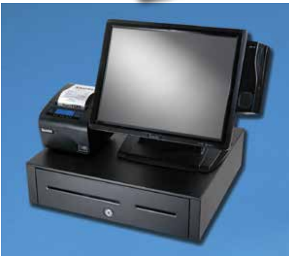
18 inch wide Model 93W Cash Drawer easily accommodates a POS printer and terminal.