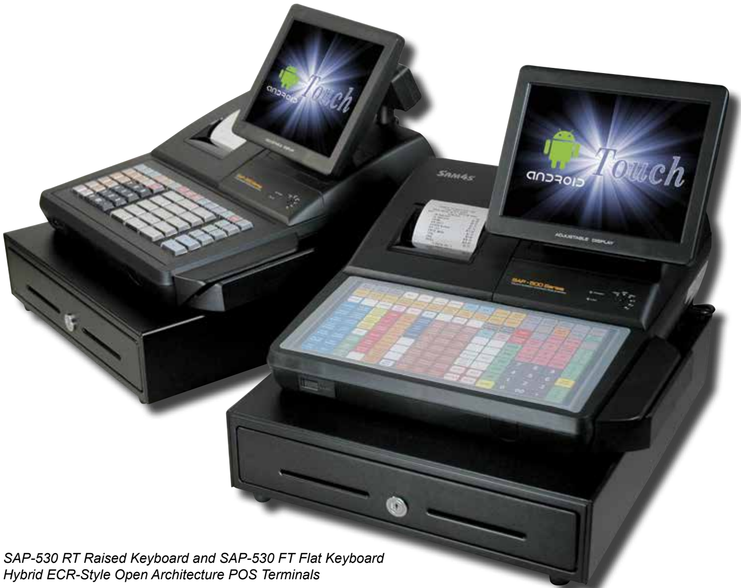
SAP-530 RT Raised Keyboard and SAP-530 FT Flat Keyboard Hybrid ECR-Style Open Architecture POS Terminals

Hybrid ECR-Style Open Architecture POS Terminals