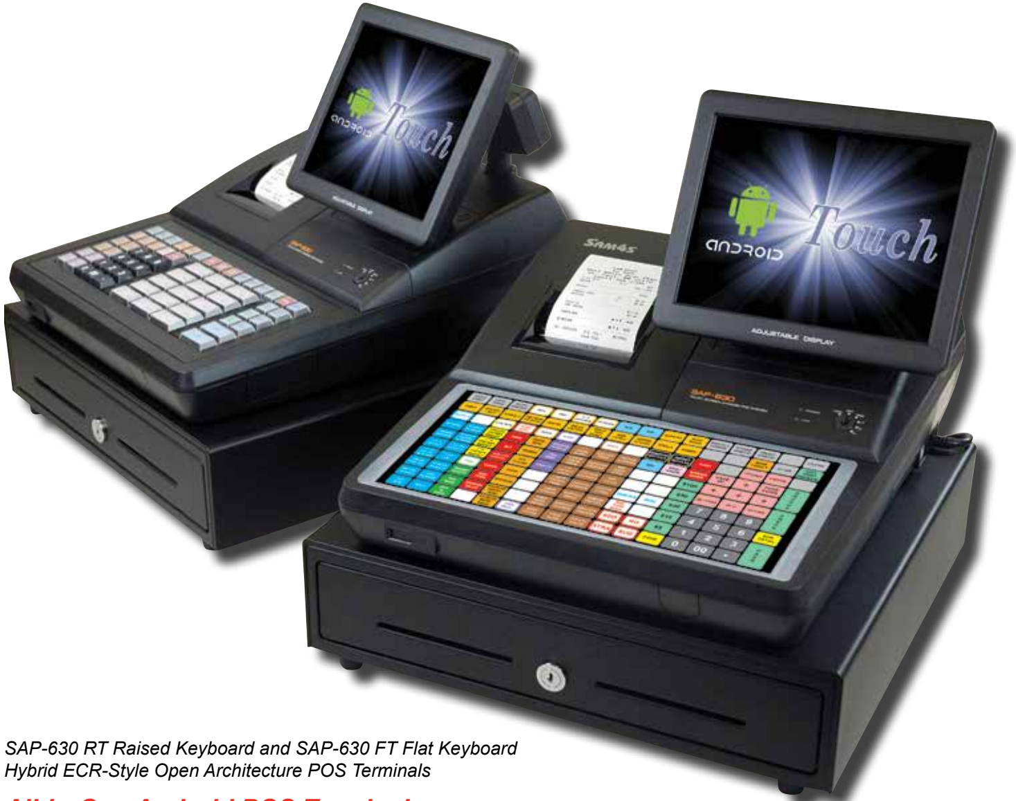
SAP-630 RT Raised Keyboard and SAP-630 FT Flat Keyboard Hybrid ECR-Style Open Architecture POS Terminals

Hybrid ECR-Style Open Architecture POS Terminals