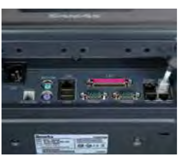
Easy to Access Ports Connect to a wide array of compatible off-the-shelf POS peripherals with six serial ports and two USB ports.