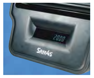
Rear Display The rear display allows consumers to monitor prices as items are entered and view the sale total.