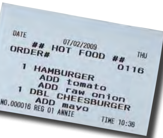
Kitchen requisition printed by the SPS-530 80mm receipt printer shown 75% actual size.

Poll by dial-up or Ethernet connection. Companion software for your PC, SAM500, supports your application by first polling sales information from individual ECRs, ECR networks or multiple remote locations. In your office SAM500 provides item file management and inventory functions. You can easily add or delete menu items and send new menu screens to your restaurants for daily, weekly or seasonal promotions.