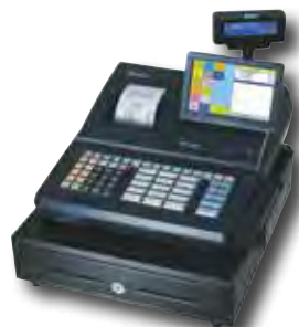
SPS-530 RT Raised-Key Keyboard; 3" Receipt Printer