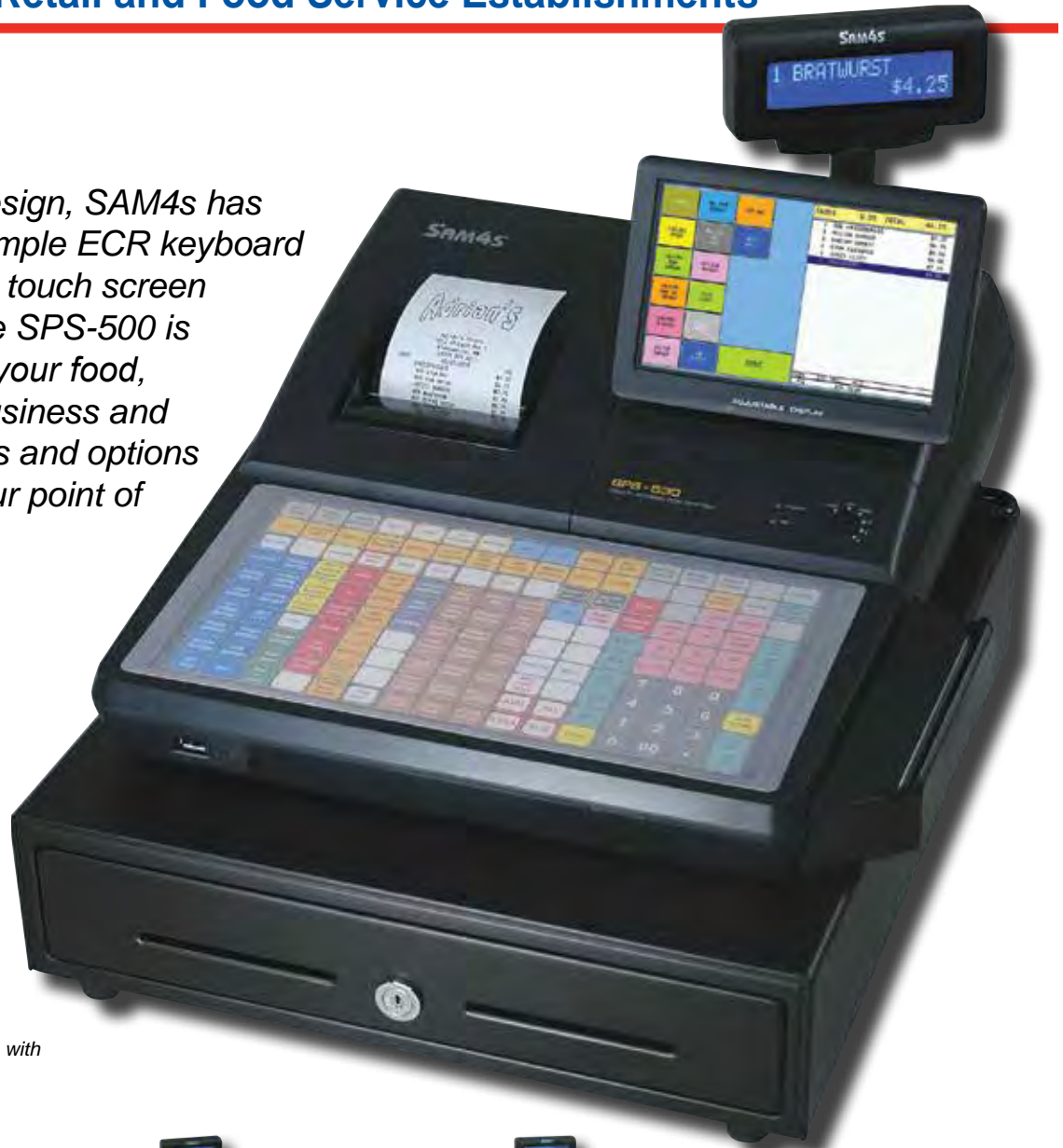
SPS-500 Series Hybrid ECRs Shown with Optional Card Reader

Featuring a hybrid design, SAM4s has combined fast and simple ECR keyboard entry with an intuitive touch screen operator display. The SPS-500 is easily configured for your food, beverage, or retail business and provides the functions and options you need to meet your point of service needs.