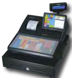
SPS-530 FT Flat Spill-Resistant Keyboard; 3" Receipt Printer