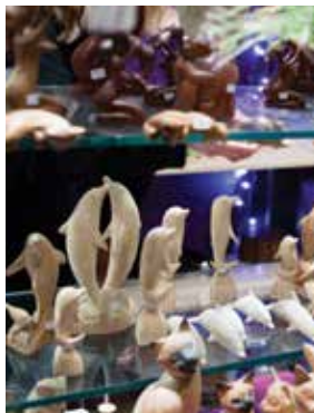
Dollar Stores / Gift Shops