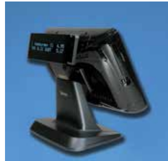
Optional Integrated Rear 2 Lines by 20 Characters VFD Customer Display