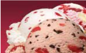
Bars / Ice Cream Parlors / Restaurants