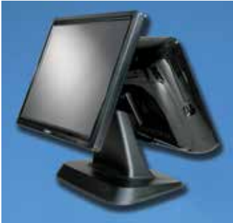
Optional Integrated 15" Rear LCD Customer Display