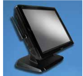
Optional WiFi Module