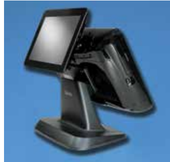
Optional Integrated 9.7" Rear LCD Customer Display