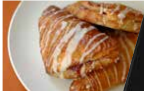
Dusty Environments Like Pizza and Bakeries