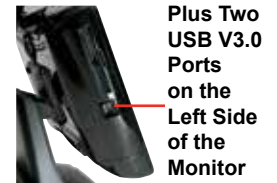
Plus Two USB V3.0 Ports on the Left Side of the Monitor

All product and company names are trademarks, service marks or registered trademarks of their respective owners. All features and specifications are subject to change without notice.