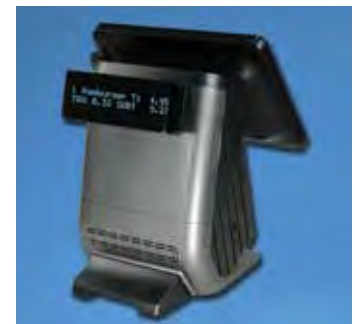
Optional Integrated VFD Customer Display