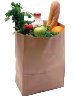
Convenience Stores / Small Grocery Stores