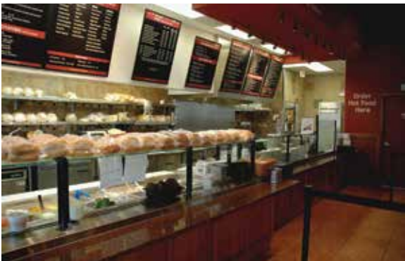
Cafeterias / Quick Service Restaurants