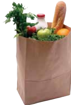
Convenience Stores / Small Grocery Stores