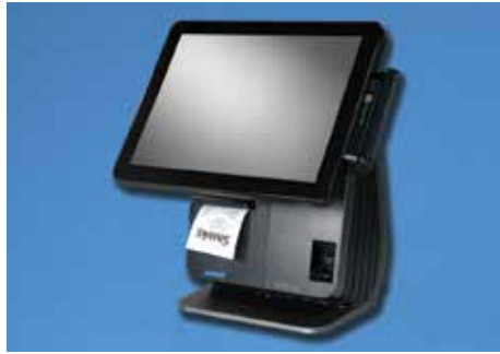
Card Reader / Printer / Fingerprint Reader