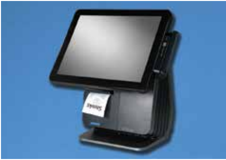
Card Reader / Printer