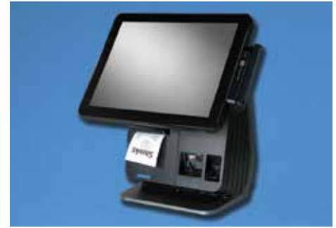
Card Reader / Printer / Scanner + Fingerprint Reader