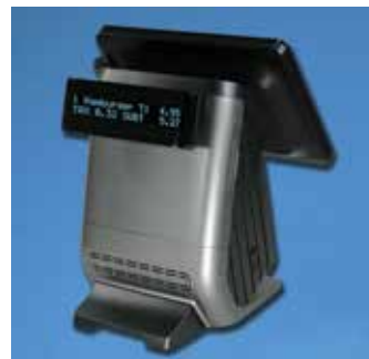
Optional Integrated Rear 2 Lines by 20 Characters VFD Customer Display