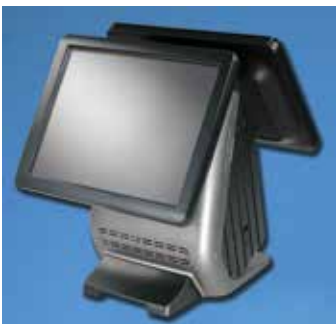
Optional Integrated 15" LCD Customer Display

Plus Two USB Ports on the Right Side Standard