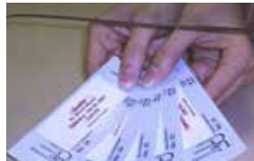
Theater Concessions / Ticket Booths / Box Offices