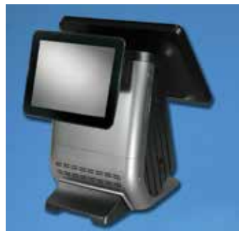
Optional Integrated 9.7" LCD Customer Display