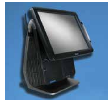
Optional WiFi Module