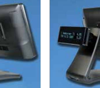
Optional Integrated 9.7" and Optional Integrated Rear 15" Rear LCD Customer 2 Lines by 20 Characters VFD Customer Display