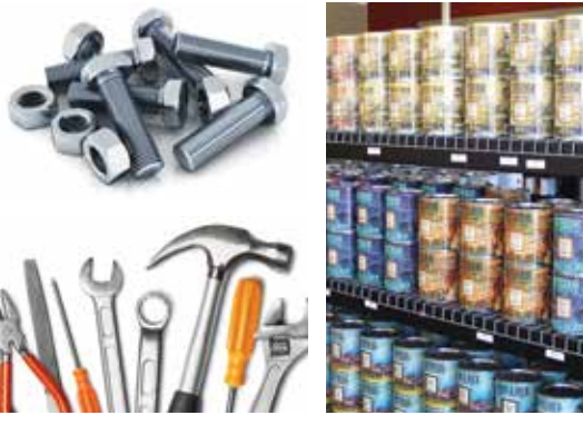
Hardware, Paint or General Retail Stores

Bars / Ice Cream / Table Service / Quick Service