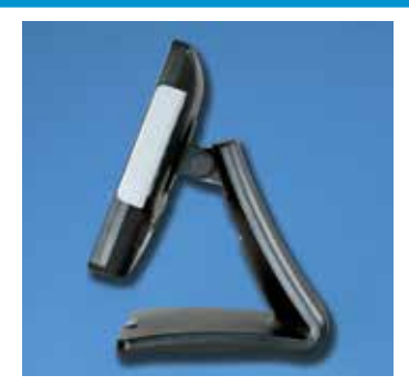
Sleek and Stylish Cabinet Design