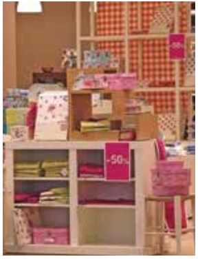
Cafeterias / Discount Stores