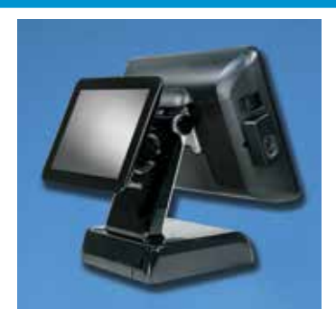
Optional Integrated 9.7" Rear LCD Customer Display