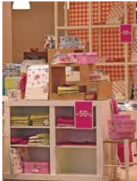
Cafeterias / Discount Stores