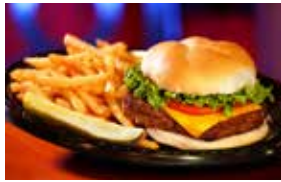
Bars / Ice Cream / Table Service / Quick Service