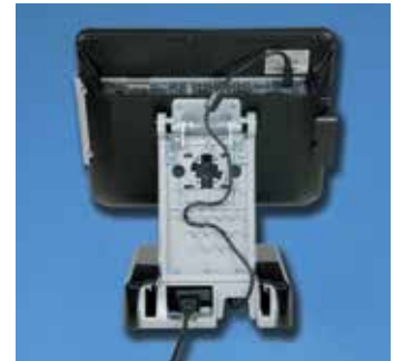
Integrated Power Supply and Cable Management Keeps Cords Hidden and Organized