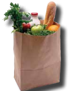
Convenience Stores / Small Grocery Stores