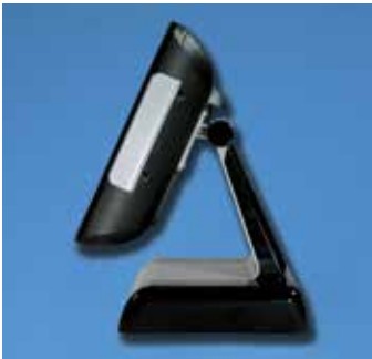
Sleek Cabinet Design