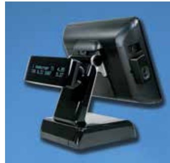
Optional Integrated Rear 2 Lines by 20 Characters VFD Customer Display