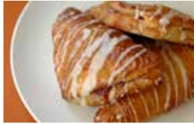
Dusty Environments Like Pizza and Bakeries