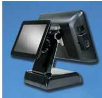
Optional Integrated 9.7" Rear LCD Customer Display