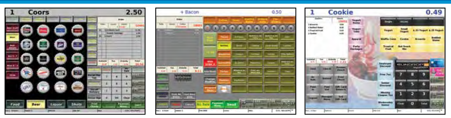
Menu items, condiments, flavors, instructions and options can be placed upon one key. When an item is registered, a specific key displays the options available for the item. You can control how many choices can be made as well as what options display next.