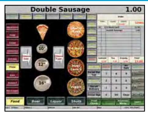
Graphic screens guide operators with minimal training.

The NCC Reflection POS delivery module will allow guest checks to be created and assigned to customers for delivery. NCC Reflection POS can maintain a customer file of 9,999 entries which can be accessed and sorted by customer ID number, phone number, address, first and last name or by city. NCC Reflection POS can create and store new customers on the fly during a first time purchase. When used with PC WorkStation NCC Reflection, POS can automatically retrieve order history allowing for fast and accurate order entry. Guest checks created for delivery are