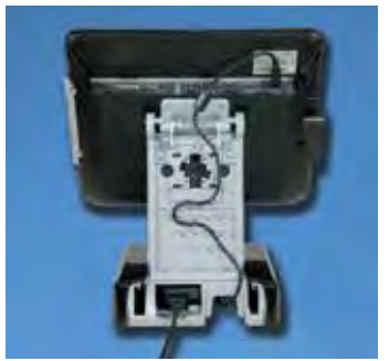
Integrated Power Supply and Cable Management Keeps Cords Hidden and Organized