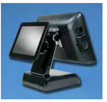
Optional Integrated 9.7 " Rear LCD Customer Display (Reflection POS for Windows)