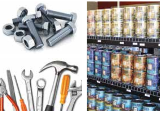
Hardware, Paint or General Retail Stores

Bars / Ice Cream / Table Service / Quick Service