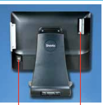
Easy Access to Solid State Drive