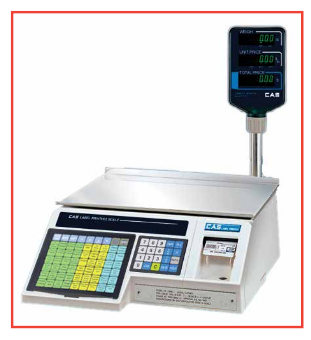
LP-1000NP Includes a Pole Display