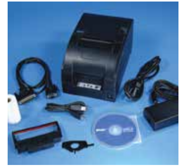
Includes Everything Necessary in the Carton