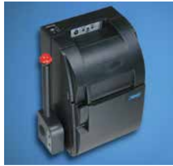
Built-In Wall Mount Capability and Optional Audio/Visual Print Messenger