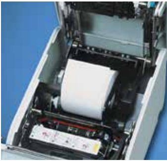
Drop and Print Paper Loading with Built-In Paper Width Selector