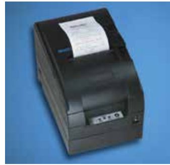
Conceal the Power Supply in the Optional Power Supply Cover