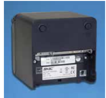
Drop and Print Paper Loading With Standard Paper Width Selector