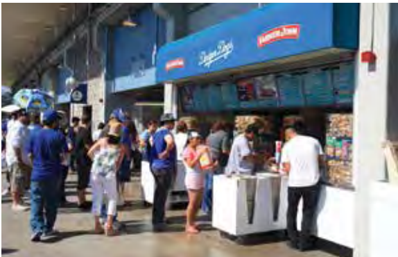
Concession Stand / Stadium Concessions