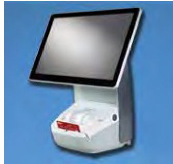
Standard Integrated Card Reader – White Cabinet Shown