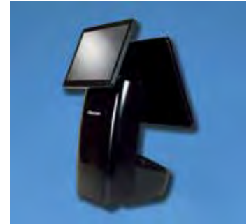
Optional Integrated 10.1" LCD Customer Display