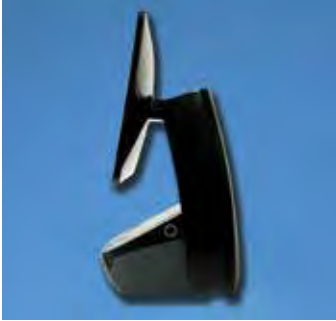
Sleek Cabinet Design