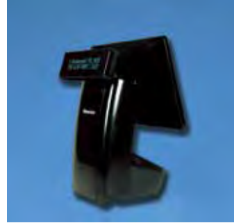
Optional Integrated Rear 2 Lines by 20 Characters VFD Customer Display