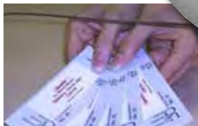
Theater Concessions / Ticket Booths / Box Offices