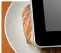
Dusty Environments Like Pizza & Bakeries