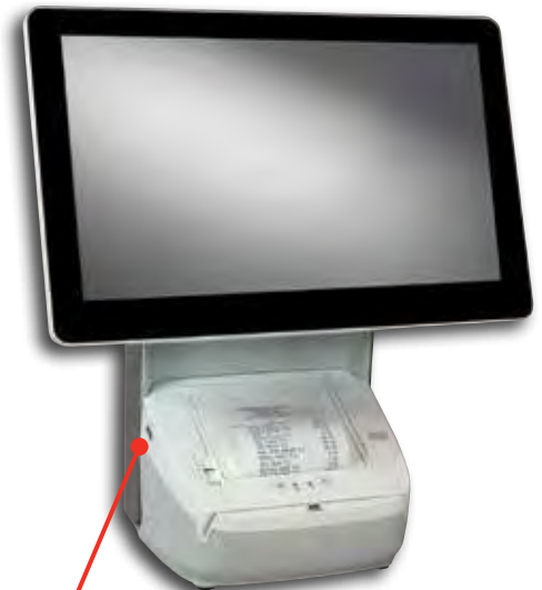
Plus One USB Port (V2.0) on the Right Side